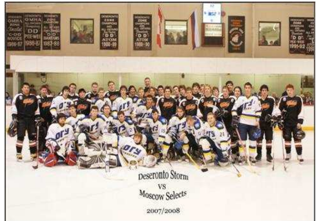
Team photos of Deseronto Storm & Moscow Selects

So come on out to the next Deseronto Storm game for an evening of exciting hockey played by potential stars of the NHL. And don't forget to pick up some team merchandise so you can cheer on the team in style. Team merchandise including ball caps, clothing, and player/team photos is sold at every home game.